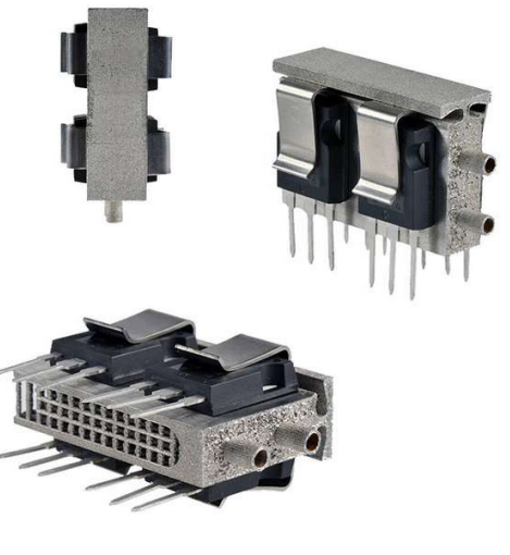
Illustration 3: Efficient and very compact fluid heat sinks from 3D metal printing help the user to safely and quickly cool down high-performance components on the circuit board.

The structure of the fluid heat sink contains two separate cooling circuits, that is, one cooling circuit per mounting side. The internal heat exchange geometry is optimised using artificial intelligence and also ensures minimised flow pressure losses.