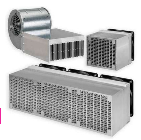
Illustration 4: Compact heat exchanging surfaces result in an extremely effective honeycomb structure which often provides very good heat distribution within the unit.

The mechanical construction of the lamella units consists of a tube made up of individual parts. The web plates in the inner air duct are fitted with a honeycomb heat exchange structure and solid aluminium blocks are joined together to form mounting plates. The resulting overall construction is now hard soldered in a further special work step and thus optimally connected mechanically as well as thermally. The heat absorbed by the mounting panels is transferred to the honeycomb structure via the web panels and finally released to the air flowing through.